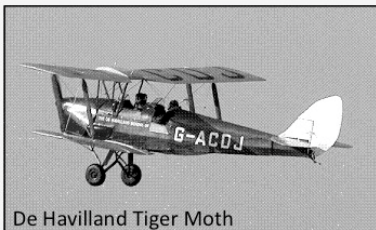
De Havilland Tiger Moth